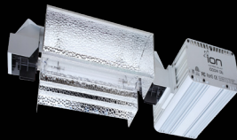
1000W HID 208-277V CLOSED