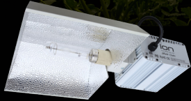
315W CMH 110-240V