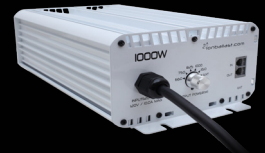
1000W DE/SE BALLAST 110-240V

*480V Special Order Available. 60-120 Day Lead Time.