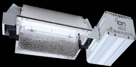
1000W HID 208-277V