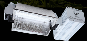
1000W HID 110-240V